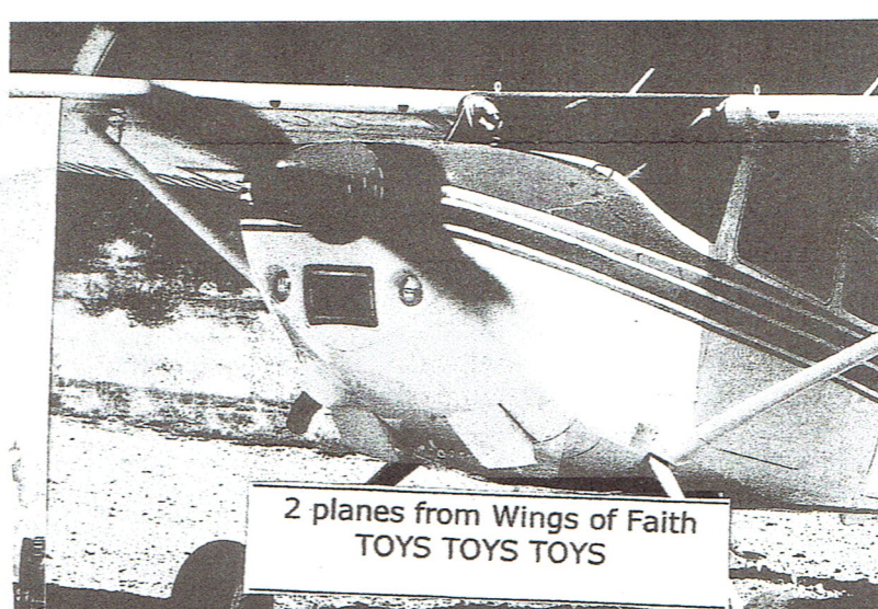
2 planes from Wings of Faith TOYS TOYS TOYS