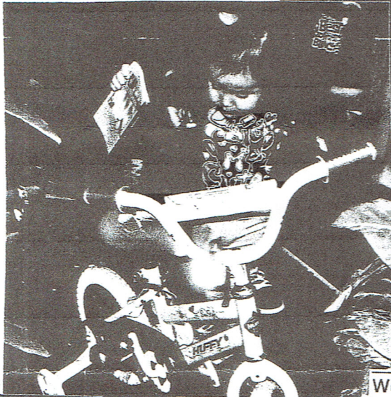
We gave out many Bibles!