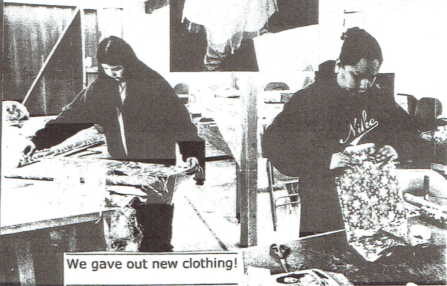
We gave out new clothing!